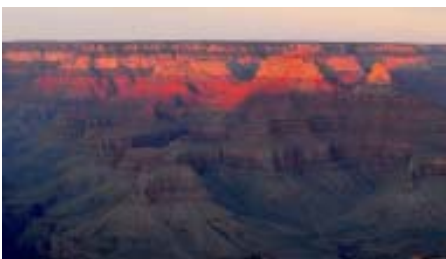
Sunset our first evening there