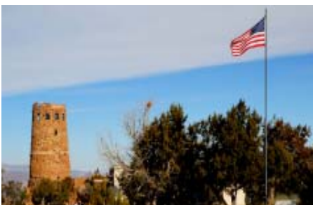
The Watchtower at the eastern entrance