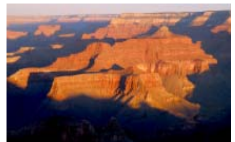
Sunrise the next day