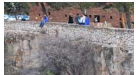
A precarious perch