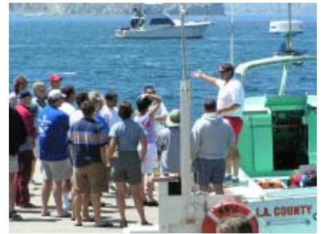
Baywatch explaining what they do