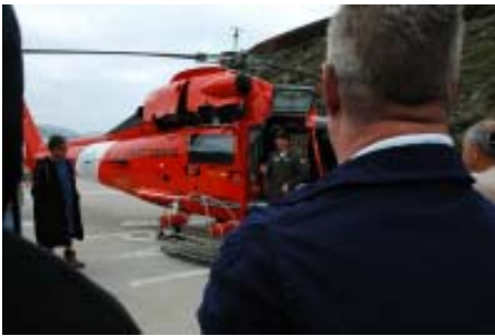
Coast Guard helicopter