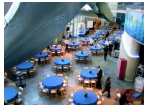
Aquarium ready to receive guests