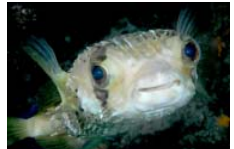
Pufferfish not a Pufferkitten