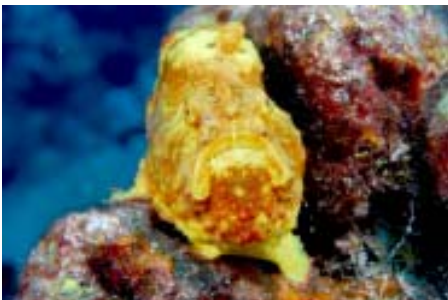
Frogfish not a Kittenfrog