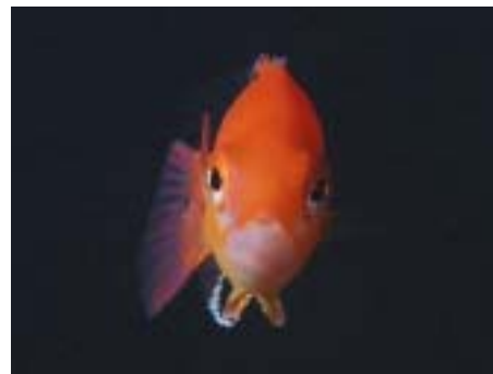
Juvy Sheephead not a Juvy Kittenhead