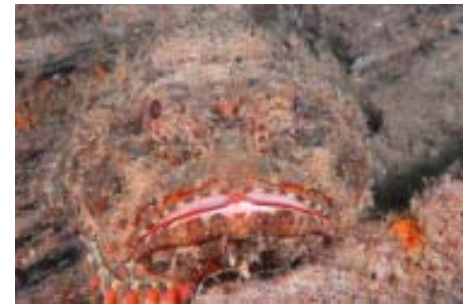
Scorpionfish not a Skittenfish