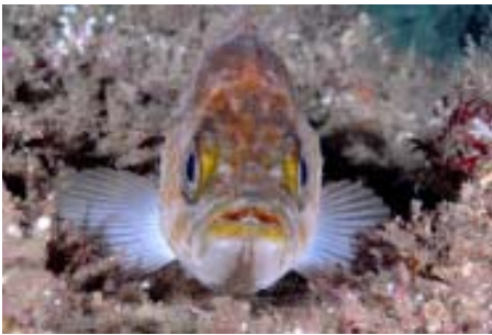
Kelp Bass not a Kelp Kittenfish