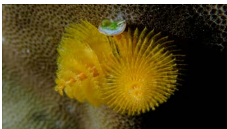
Maldives with the Manthiri