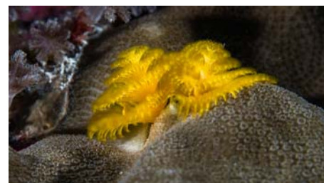
Yap with Manta Ray Bay