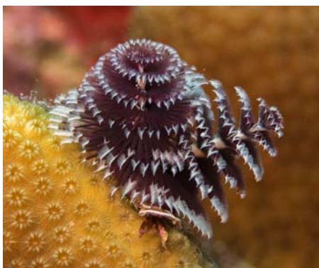
Bonaire with Buddy Dive