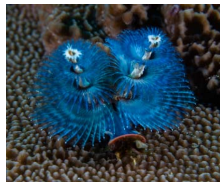
Indonesia with Murex Manado Resort