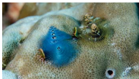
Palau with the Palau Aggressor II