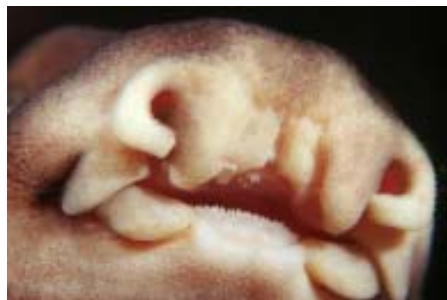
Horn Shark mouth in SoCal