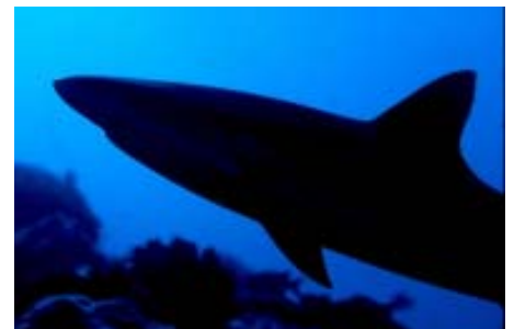
Shark silhouette in Tahiti