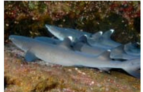
Whitetips at Roca Partida (Socorro)