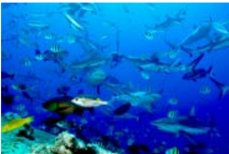
Feeding frenzy In Yap