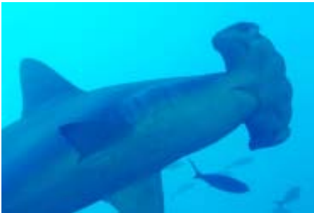
Hammerhead in Cocos