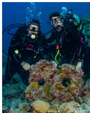
Stone Money underwater (Yap)