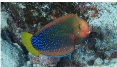
Yellowtail Coris (Yap)