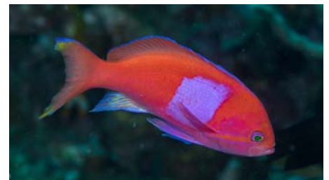
Squarespot Anthias (Indonesia)