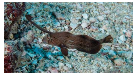
Peacock Razorfish (Yap)