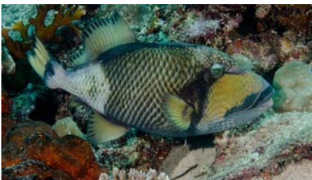
Titan Triggerfish (Indonesia)