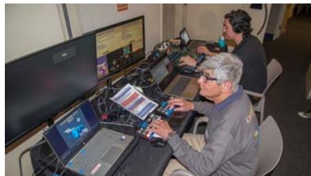
Making the live-stream happen