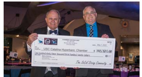
The final result