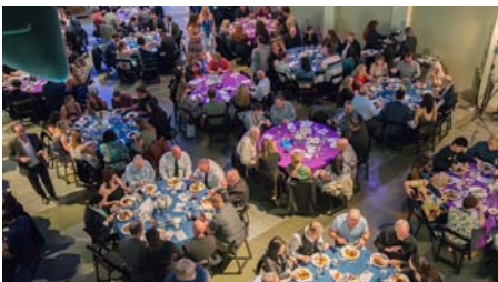
Chamber Eve diners