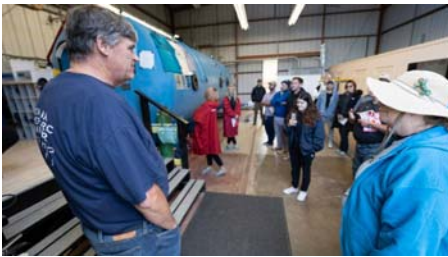
Inside the Chamber hanger