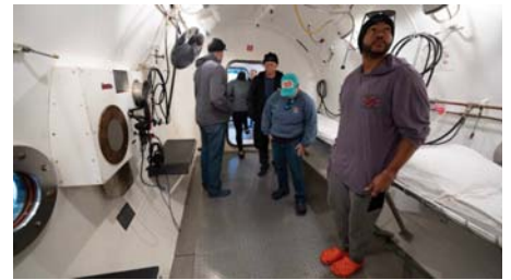
Inside the Chamber itself