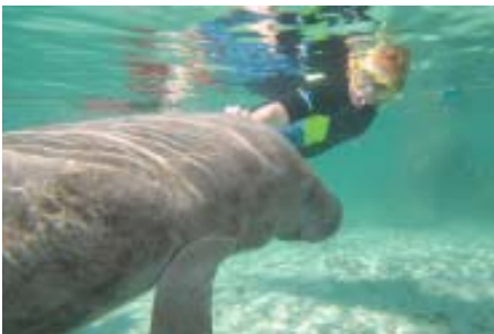
Chwecking out a snorkeler