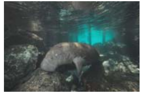
Coming down the channel