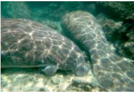
Taking an afternoon nap