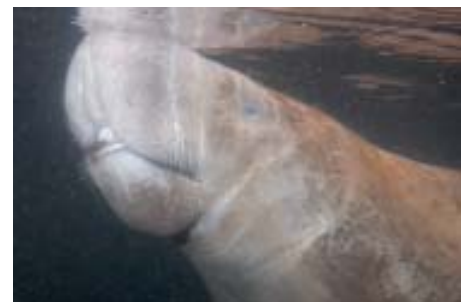
Taking a snort of air