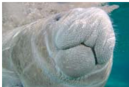
Who's watching whom?