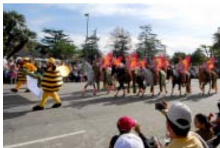
Who thought this outfit was a good idea??