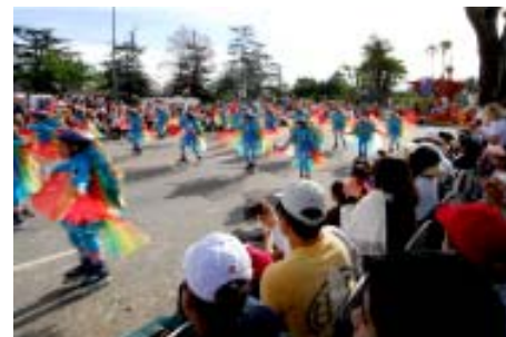
The kids from Shanghai were still skating at the end