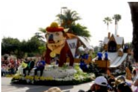
We also really liked the snowboarding dogs