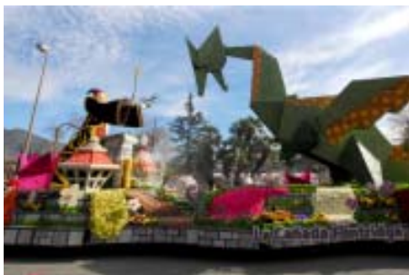
We loved the wizard and the origami dragon