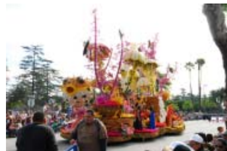
Hands-down favorite: Fish from Downey