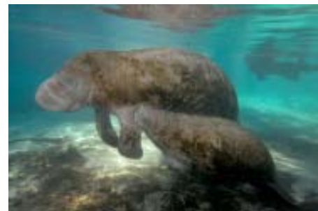
Mom & calf Crystal River, FL