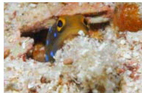
Coughing up gravel Baja