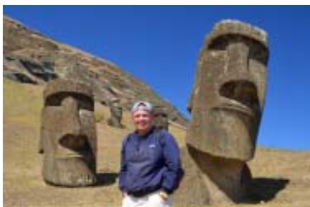
Lots of big heads at Easter Island