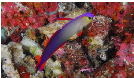
Elegant dartfish (Indo-Pacific)