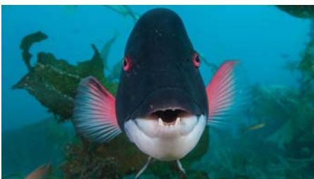
Male California Sheephead (SoCal waters)