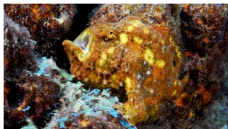
Frogfish (worldwide but hard to spot)