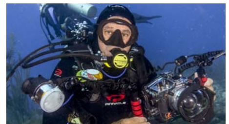
Kurtisfish (on every Reef Seekers trip)