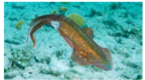
Squid (generally found worldwide)